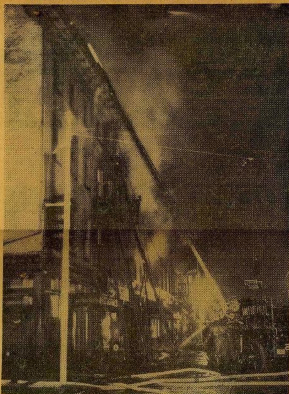
Thrilling ladder work by firemen marked the $20,000 three-alarm fire in which one man jumped to his death at 15-25 Meridian street, East Boston, yesterday.

to the window when flames roared up the stairway inside the house.