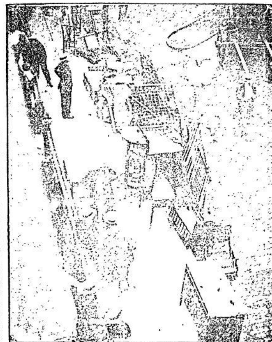
HOUSEHOLD EFFECTS SAVED FROM FLAMES PILED ON THE SIDEWALK.